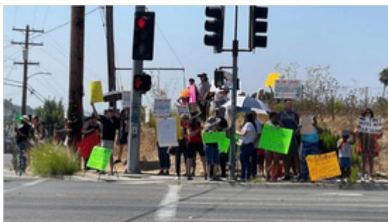
Sun Valley Community Opposes Placing Tiny Homes at Metrolink Station Parking Lot

The success of the July 31 rally at the Sun Valley Metrolink Station underscores the critical role of community organizing in shaping a just and resilient future for all residents regardless the color of skin, socio-economic standing, income, or zip code.